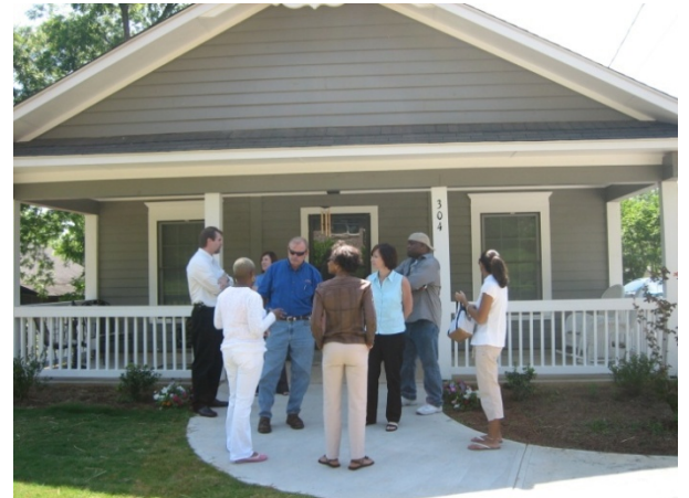
Visiting other communities