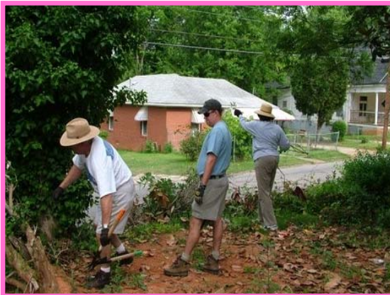
Clean up day